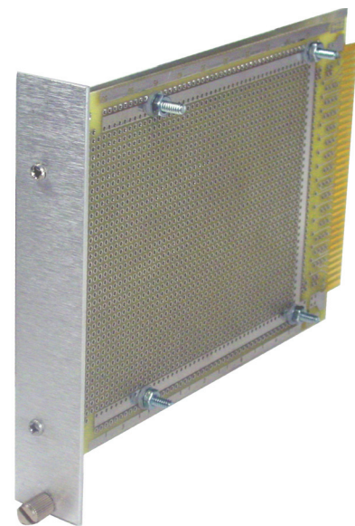
Card Mount Module Plugboard™ sold separately