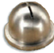
3M™ Cylinder Adhesive Spray Tip QSS

Standard Output for use with any 3M™ Cylinder Spray adhesive products. Includes Cylinder Adhesive 9501 Spray Tip.