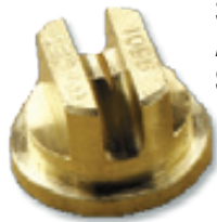
3M™ Cylinder Adhesive Spray Tip 9501

A unique, high output wide width spray pattern tip designed specifically for use with 3M™ HoldFast 70 and 3M™ Polystyrene Foam Insulation 78 HT Cylinder Spray Adhesives.