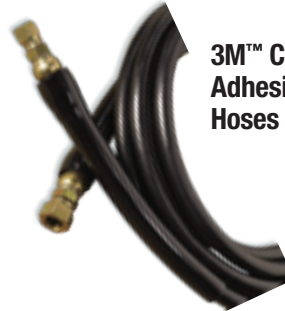
3M™ Cylinder Adhesive Hoses

A standard output, wide spray width tip.