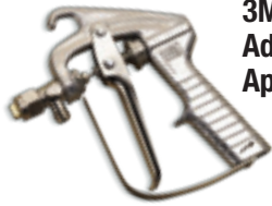
3M™ Cylinder Adhesive Applicator

Standard Output for use with any 3M™ Cylinder Spray adhesive products. Includes Cylinder Adhesive 9501 Spray Tip.