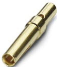
D-SUB crimp contact, contact inserts: x , connection method: Crimp connection, connection cross section: AWG 24- 20

Please be informed that the data shown in this PDF Document is generated from our Online Catalog. Please find the complete data in the user's documentation. Our General Terms of Use for Downloads are valid ( http://phoenixcontact.com/download )