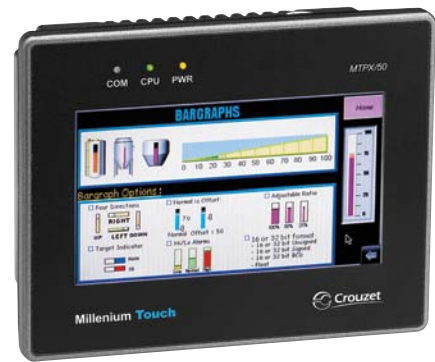
Programmable touch panel MTP6/50