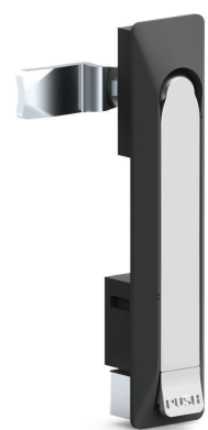
No Cylinder '00'