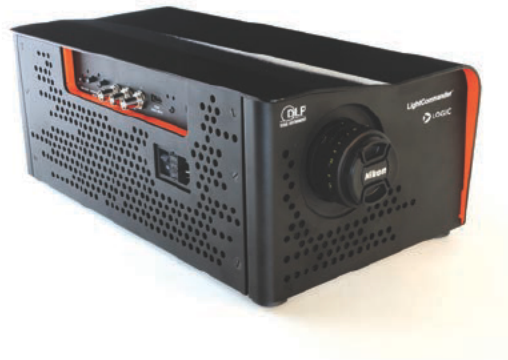
DLP LightCommander Development Kit

The DLP LightCommander takes DLP development to a new level. The fully self-contained kit benefits developers looking to