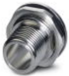
Housing screw connection, PlugLink:M12, Rear mounting, M15 x 1

Housing screw connection - SACC-BP-M-M12/M15-6-SMD - 1414000