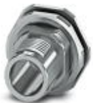
Housing screw connection, PlugLink:M12-SPEEDCON, Rear mounting, M15 x 1

Housing screw connection - SACC-BP-M-M12/M15-6-SMD SCO - 1414002