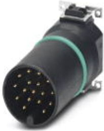
Flush-type connector, 17-position, PlugLink:straightLink:M12, A-coded, PCB mounting, SMD

Please be informed that the data shown in this PDF Document is generated from our Online Catalog. Please find the complete data in the user's documentation. Our General Terms of Use for Downloads are valid ( http://phoenixcontact.com/download )