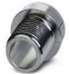
Housing screw connection, pin, for the two-part M12 SMD connector, for press-in mounting.

Housing screw connection - SACC-FP-M-M12/PRESS SMD - 1412080