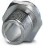
Housing screw connection, PlugLink:M12, Front mounting, M14 x 1

Housing screw connection - SACC-FP-M-M12/M14 SMD - 1412078