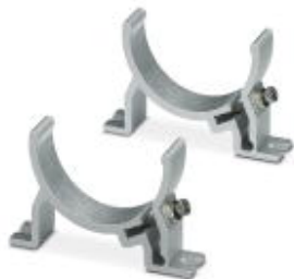
Mounting holder, AlMgSi0,5: Aluminum, for machine lights PLD M 260 .../D70, Swiveling range \pm 30^\circ

Please be informed that the data shown in this PDF Document is generated from our Online Catalog. Please find the complete data in the user's documentation. Our General Terms of Use for Downloads are valid ( http://phoenixcontact.com/download )