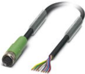
Sensor/Actuator cable, 8-position, PUR, Black RAL 9005, Free cable end, on Socket straight M8, Cable length: 5 m

Please be informed that the data shown in this PDF Document is generated from our Online Catalog. Please find the complete data in the user's documentation. Our General Terms of Use for Downloads are valid ( http://download.phoenixcontact.com )