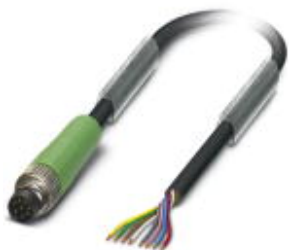
Sensor/actuator cable, 8-position, PUR halogen-free, black RAL 9005, Plug straight M8, on free cable end, cable length: 3 m

Please be informed that the data shown in this PDF Document is generated from our Online Catalog. Please find the complete data in the user's documentation. Our General Terms of Use for Downloads are valid ( http://phoenixcontact.com/download )