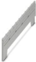
Component housing, length: 111.9 mm, Partition, color: light gray, width: 2.69 mm, height: 28 mm

Please be informed that the data shown in this PDF Document is generated from our Online Catalog. Please find the complete data in the user's documentation. Our General Terms of Use for Downloads are valid ( http://phoenixcontact.com/download )