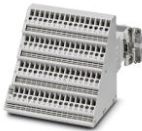
HEAVYCON terminal adapter female insert, D64 series, 64-pos., left protective conductor connection for the right side of the control cabinet, screw connection

Please be informed that the data shown in this PDF Document is generated from our Online Catalog. Please find the complete data in the user's documentation. Our General Terms of Use for Downloads are valid ( http://download.phoenixcontact.com )