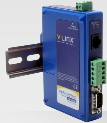
MESR900 series MESR9xx Modbus Gateway

Before you begin, be sure you have the following: