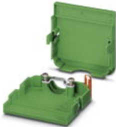
Cable housing, Pitch: 0 mm, Number of positions: 7, Dimension a: 29.09 mm, Color: green

Please be informed that the data shown in this PDF Document is generated from our Online Catalog. Please find the complete data in the user's documentation. Our General Terms of Use for Downloads are valid ( http://download.phoenixcontact.com )