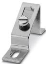
Angled brackets with M6 screw, DIN rail limit stop, for fixing DIN rails at an angle of 30°, with M6 screw, height: 35.4 mm

Please be informed that the data shown in this PDF Document is generated from our Online Catalog. Please find the complete data in the user's documentation. Our General Terms of Use for Downloads are valid ( http://phoenixcontact.com/download )