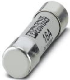
Fuse, 10.3x38 mm, up to 1000 V DC, gPV characteristics

Please be informed that the data shown in this PDF Document is generated from our Online Catalog. Please find the complete data in the user's documentation. Our General Terms of Use for Downloads are valid ( http://phoenixcontact.com/download )