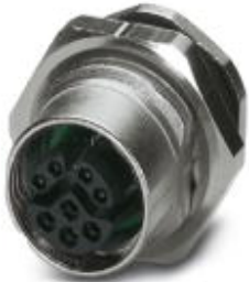
Hybrid flush-type socket, Ethernet, 8-pos., M12 SPEEDCON, rear/screw mounting with M16 thread, with straight solder connection

Please be informed that the data shown in this PDF Document is generated from our Online Catalog. Please find the complete data in the user's documentation. Our General Terms of Use for Downloads are valid ( http://phoenixcontact.com/download )