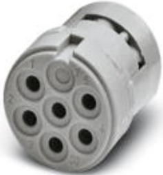
Contact insert, Number of positions: 7, Type of contact: Socket, Crimp connection

Please be informed that the data shown in this PDF Document is generated from our Online Catalog. Please find the complete data in the user's documentation. Our General Terms of Use for Downloads are valid ( http://phoenixcontact.com/download )