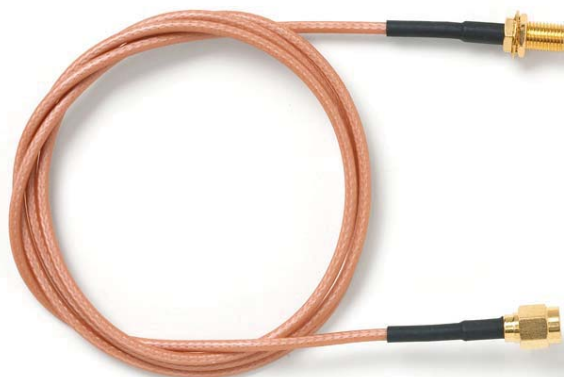
Model 73070-BB SMA Plug to SMA Bulkhead Jack, RG316/U