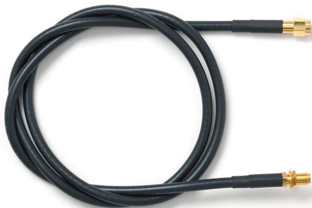
Model 73070-C SMA Plug to SMA Bulkhead Jack, RG58C/U