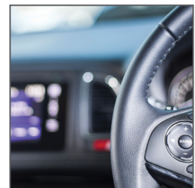
Steering Wheel Switches