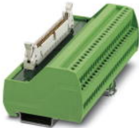
VARIOFACE interface module

Please be informed that the data shown in this PDF Document is generated from our Online Catalog. Please find the complete data in the user's documentation. Our General Terms of Use for Downloads are valid ( http://phoenixcontact.com/download )