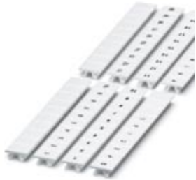
Zack marker strip, 10-section, horizontally labeled with the consecutive numbers: 21 ... 30, white, width: 8 mm

Please be informed that the data shown in this PDF Document is generated from our Online Catalog. Please find the complete data in the user's documentation. Our General Terms of Use for Downloads are valid ( http://phoenixcontact.com/download )